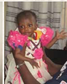
Joywrisper - Fortis Malar Hospital, Chennai, India (OneVoice LaLaLove Campaign)