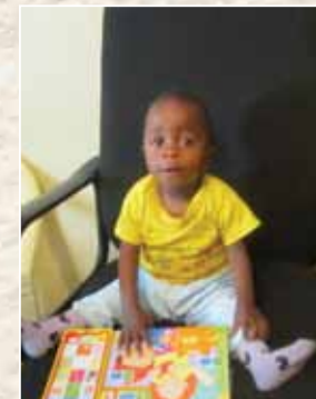
Darwin - The Mater Hospital, Nairobi, Kenya (Gift of Life of New Jersey)